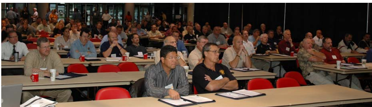
National AHIMT Training Conference held at Northern Illinois University October 15-16, 2008