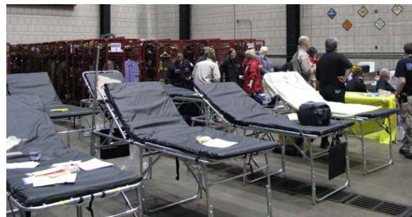
Alternate Treatment site set up in progress at CFD Academy