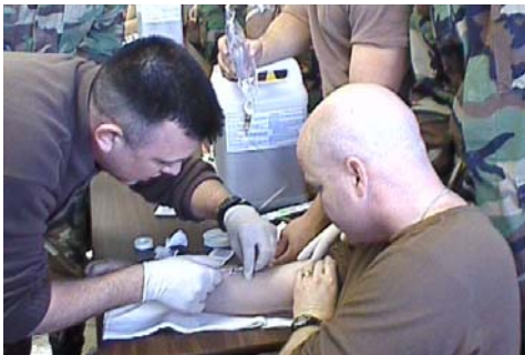
IV fluids administered during CERP training