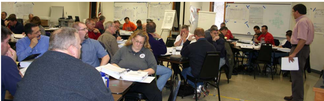
National All Hazard Incident Management Training